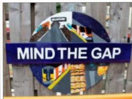
An important reminder