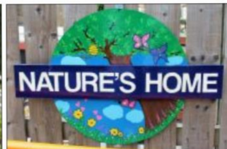
A refreshing message